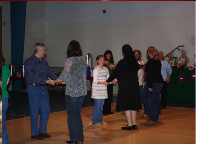
On November 7th, families dusted off their boots and kicked up their heels at the Fall Family Dance. With direction from the professional Square Dance Callers, folks learned to promenade, allemande, dosado and right arm turn all while having lots of laughs. It was a great time and a great cause.