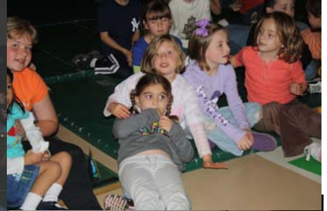
The Great Pumpkin Movie Night, held October 30th was a great success. Children decorated pumpkins, enjoyed the make-your-own-sundae bar and watched the movie It's A Great Pumpkin, Charlie Brown .